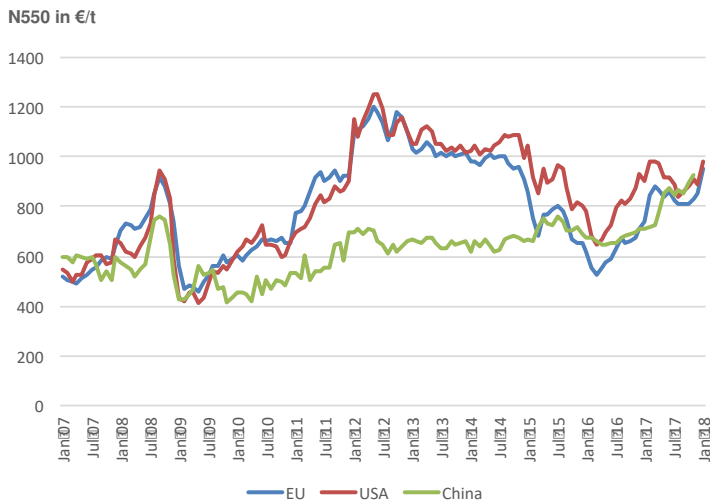
Comparison of regional prices for carbon black N550 in euros

The loosening correlation between prices of carbon black and oil observed in recent years continued in 2017. This is attributable to higher environmental standards in the traditional carbon black industry and an increase in specific raw material costs as well as the US stagnation and European reduction of carbon black production capacities. In future, the industry assumes that these pricing links will continue to weaken, and all the leading manufacturers have indeed raised their prices over the past 24 months.