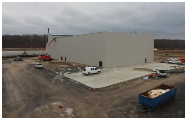
The planned Pyrolyx production facility in Terre Haute, Indiana (USA) and construction progress in January 2018